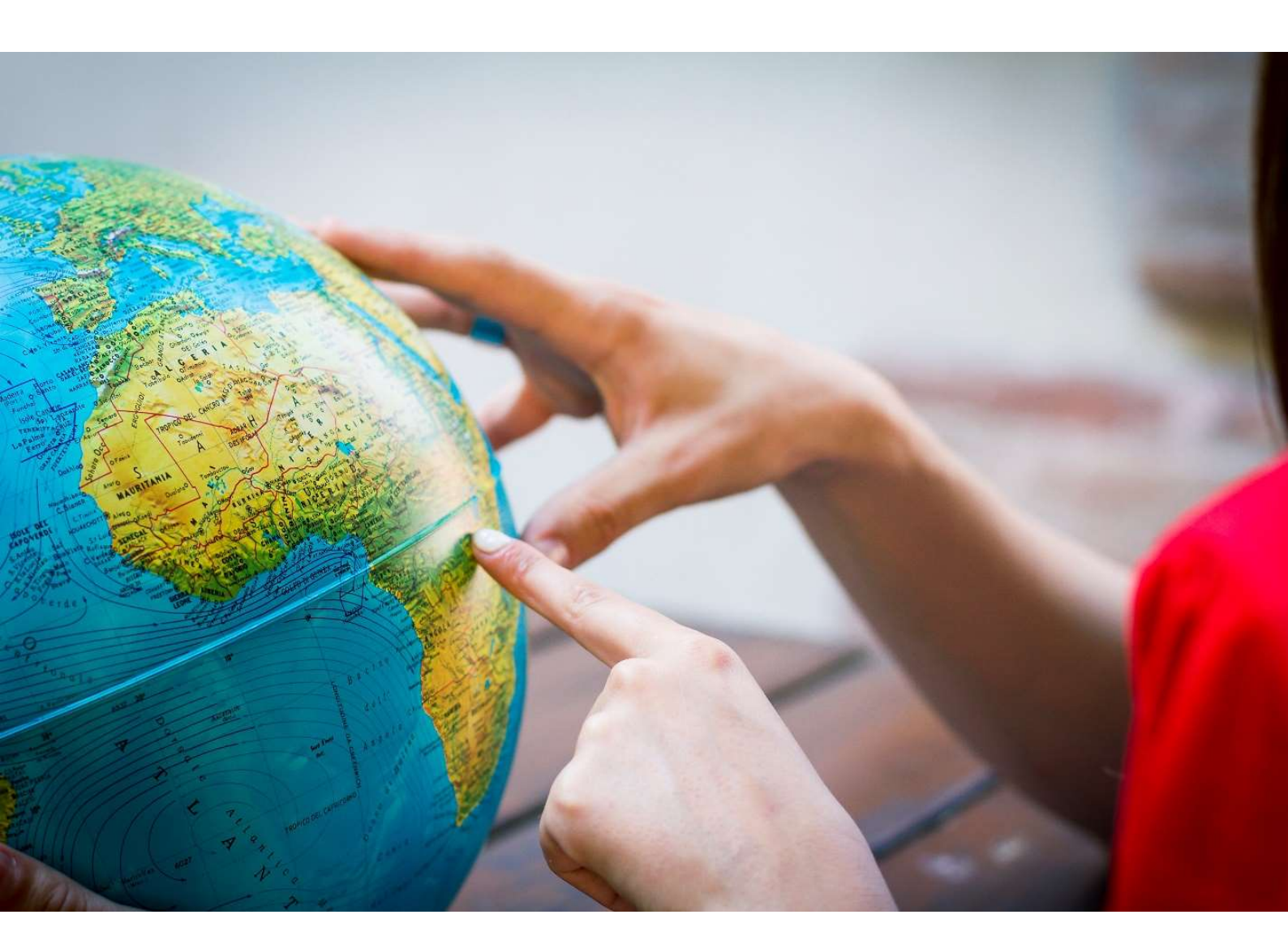
The Solvency and Financial Condition Report 2020 – Public